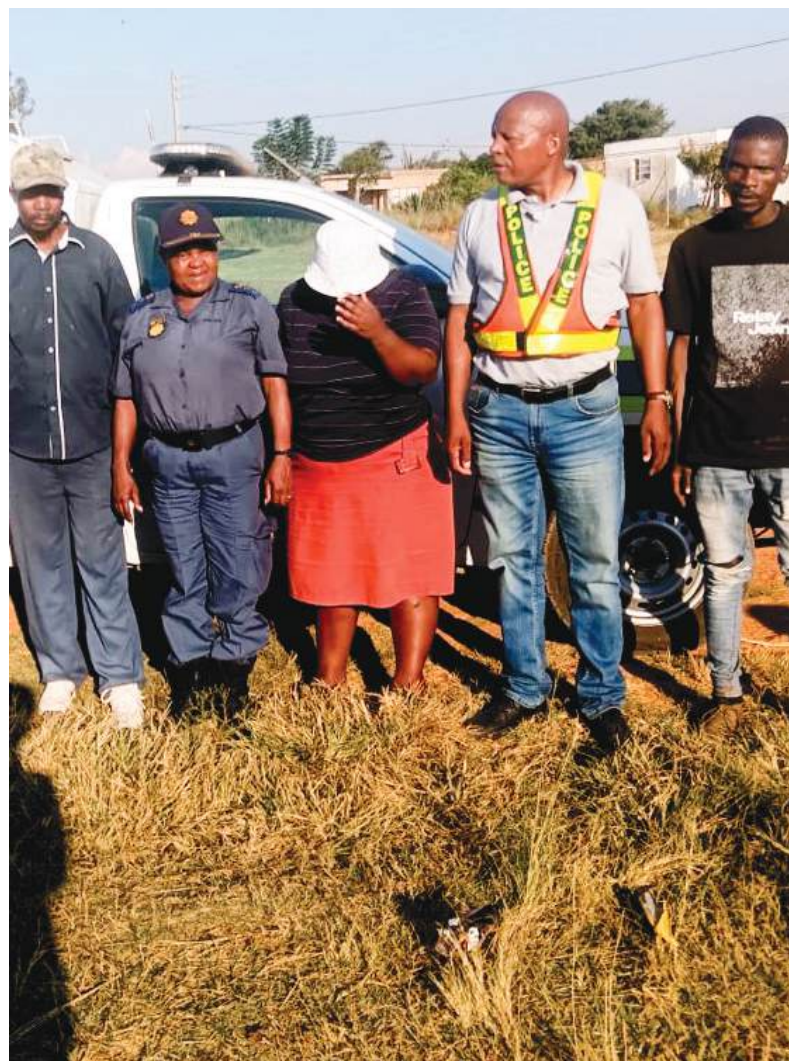
The Tafelkop newly elected CPF is promising to work jointly with the Motetema SAPS to fight the scourge of crime in the village.

"The newly elected CPF is set to work closely with the police and community to restore safety in Ward 25. We want the police to conduct patrols day and night, and we need their support to make our community a safer place," urged Nkgadima.