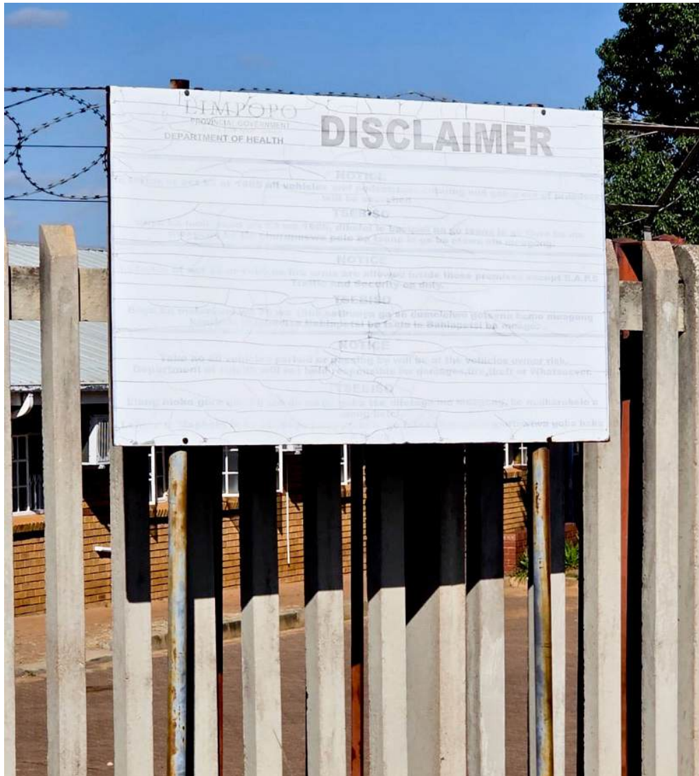
Locals accuse staff members at Kwarilaagte Clinic in Ntwane Village, Dennilton, of negligence.

NTWANE - The sign outside still reads “24-Hour Service,” but for the elderly residents from Ntwane Village in Dennilton, who arrive before sunrise seeking medical care, the gates of Kwarilaagte Clinic tell a different story, locked, guarded, inaccessible.