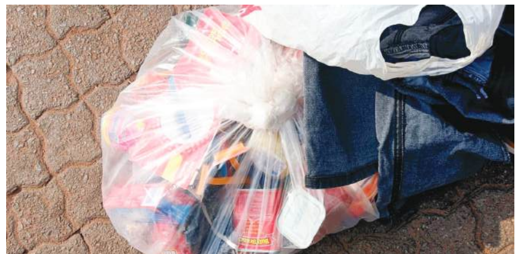
The suspected stolen goods which were recovered by the police from a businessman in Apel.