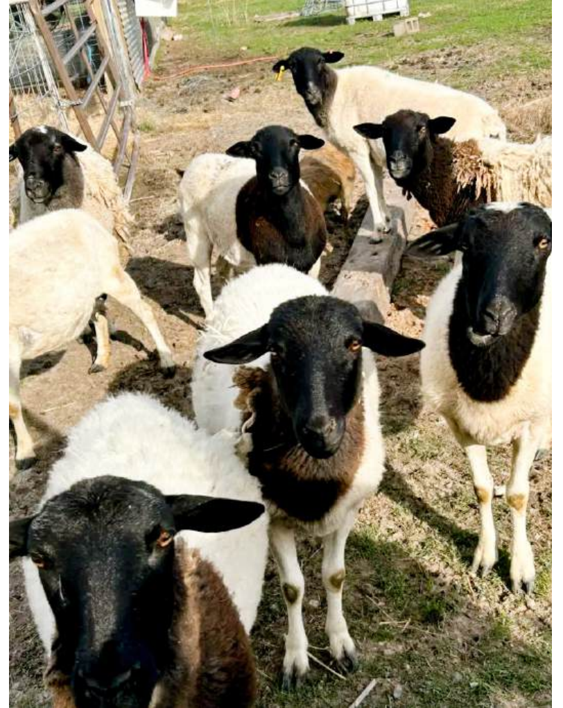
The police in Motetema have launched a manhunt after 14 sheep were stolen at Sterkfontein Village.

STERKFRONTEIN - The police in Motetema outside Groblersdal are urging anyone with information to come forward after 14 sheep were stolen from Sterkfontein Village earlier this month.