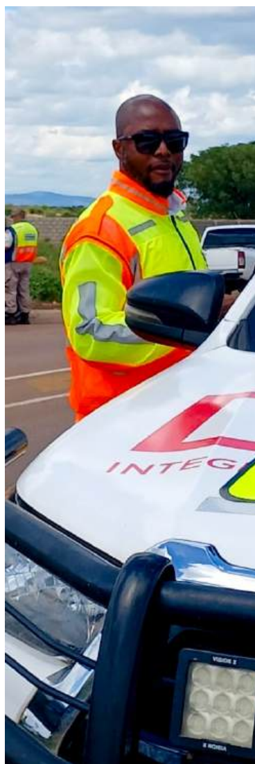
The Limpopo Department of Transport and Community Safety announced that 33 drunk drivers were arrested in the province during Phuza Weekend Operation.

“Motorists are urged to plan ahead when consuming alcohol. If you plan to drink, do not drive. Let us all play our part in ensuring we arrive alive,” she said.