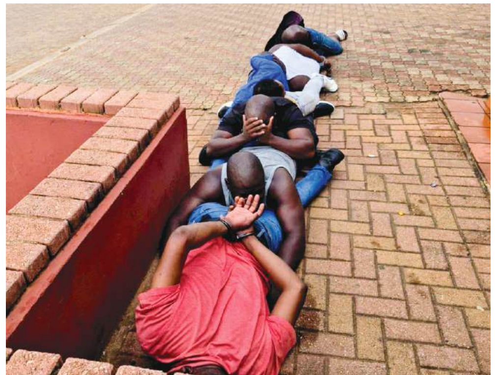
The suspects after they were arrested in connection with a series of crimes committed around Limpopo Province.

He said the suspects are scheduled to appear before Sekhukhune Magistrate's Court soon.