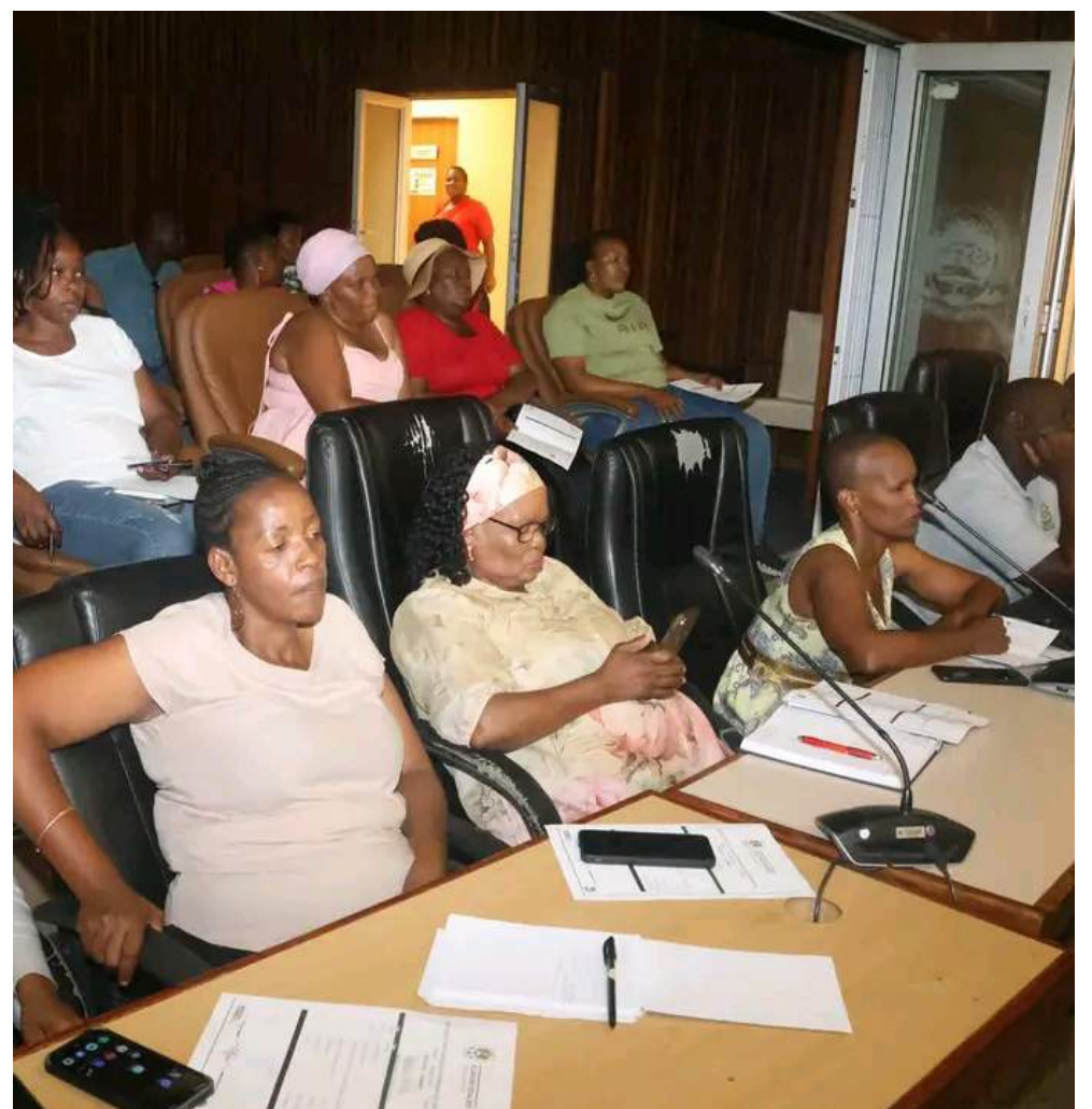
Stakeholders from different structures attended during the IDP Representative Forum meeting held at EMLM Municipal Chamber in Groblersdal.

The municipality also expressed appreciation to all stakeholders for their active participation and constructive contributions.