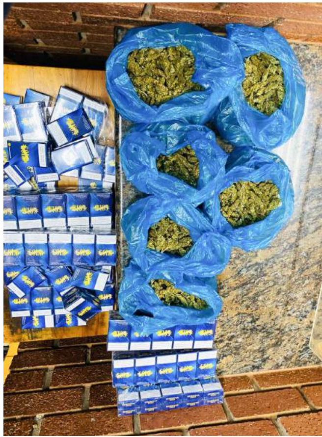
Illicit cigarettes and drugs were recovered during Limpopo Police Operation Shanela conducted recently across the province.

LIMPOPO - In a significant blow to crime in Limpopo, the police in the province have arrested 477 suspects for various offenses during a week-long operation. The operation, dubbed "Operation Shanela", was conducted across Limpopo Province jointly with external law enforcement agencies from Monday 5 to Sunday 12 April 2026.