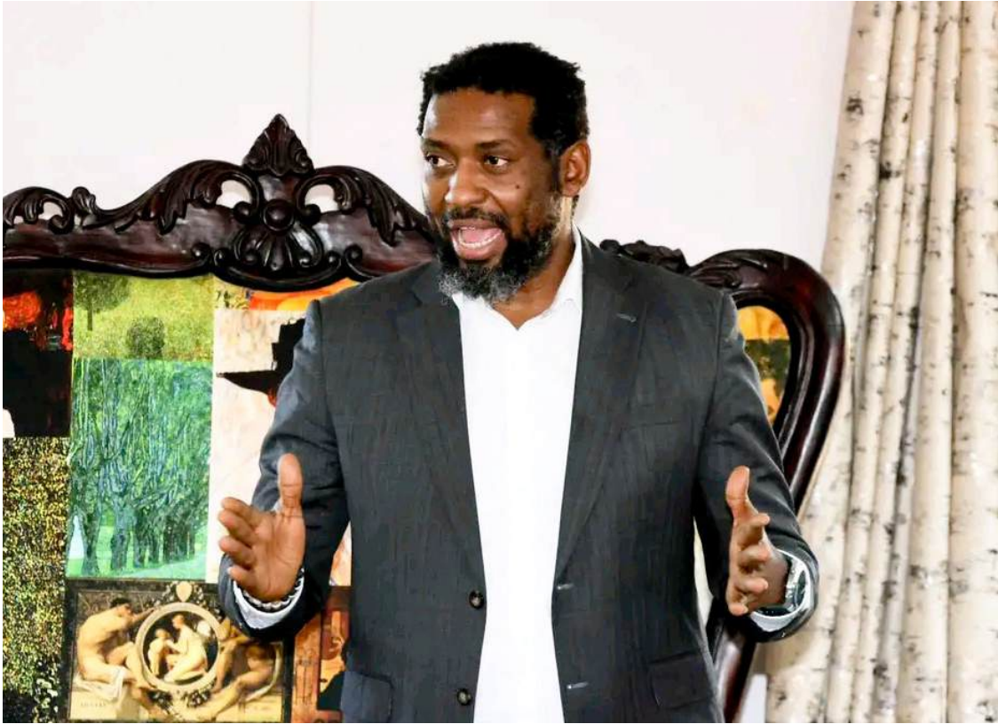
Minister of DHET, Buti Manamela, addressing the meeting at Bapedi Kingdom's Tšate III Great Palace in Mhlaletse Village.