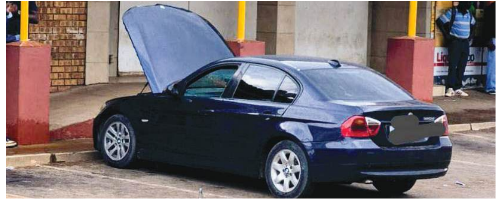
The BMW which was used by the suspects for the commission of crimes.

LEBOWAKGOMO - An intelligence driven operation in Lebowakgomo has resulted in the arrest of six suspects and the recovery of stolen goods, after weeks of targeted business burglaries across the province.