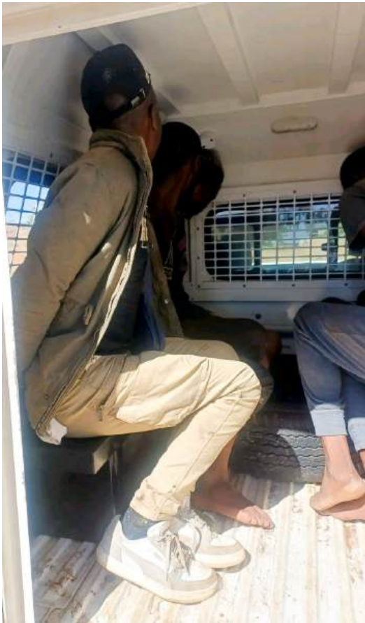
The police in Limpopo have arrested multiple suspects during a province-wide Operation Shanela.