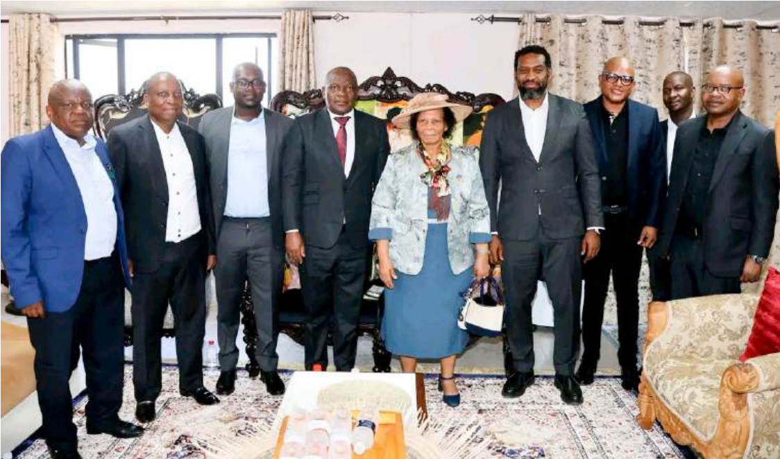
Minister of DHET, Buti Manamela, with Kgoshigadi Manyaku Thulare, and other dignitaries during the engagement.